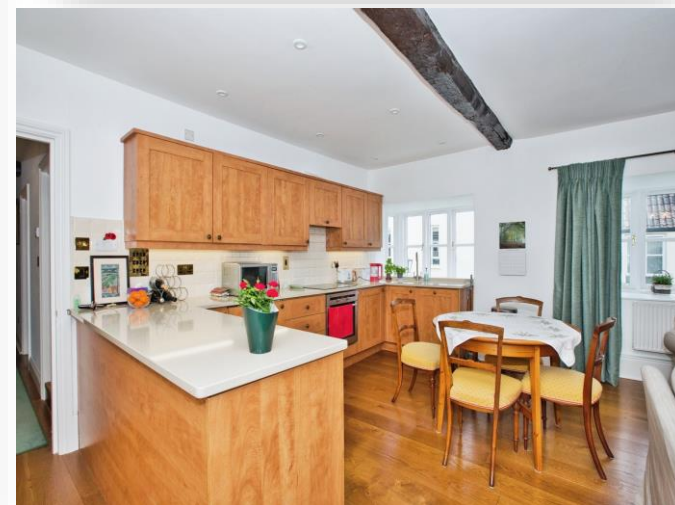
11 Anseres Place, Wells, BA5 2RT