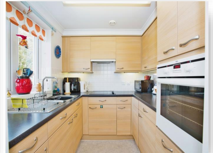
34 Tor View Court, Somerton Road, Street, BA16 0FE