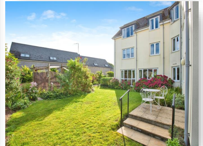
Tor View Court, Somerton Road, Street, BA16 0FE