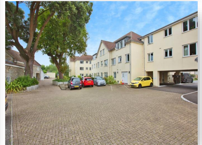
Tor View Court, Somerton Road, Street, BA16 0FE