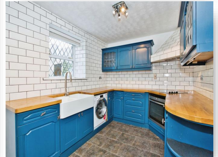
Dean, Shepton Mallet, BA4 4SA