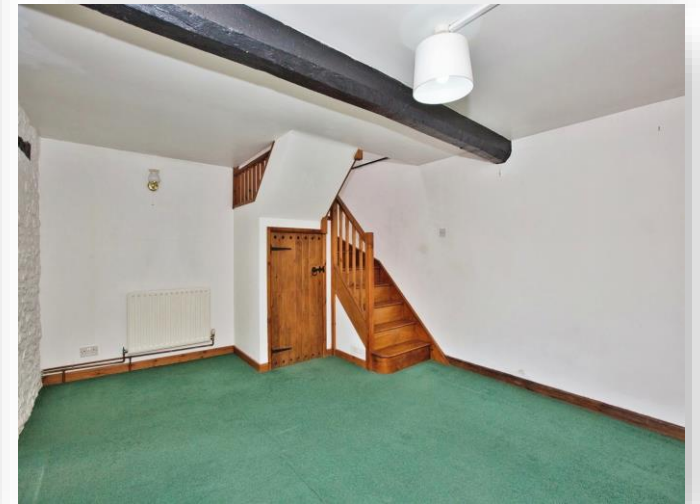
Victoria Lane, Evercreech, Shepton Mallet, BA4 6JW