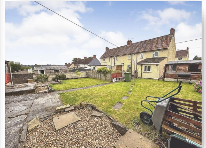
Southover Road, High Littleton, Bristol, BS39 6HR