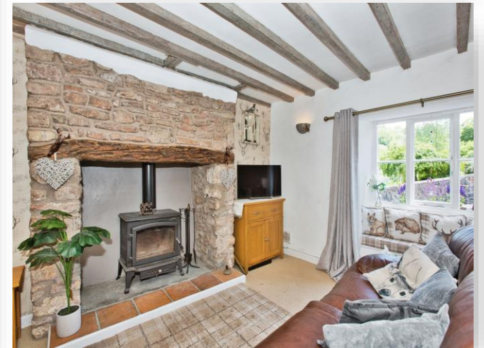
East View Cottages, Croscombe, Wells. BA5 3QR