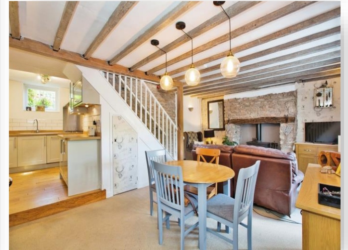
East View Cottages, Croscombe, Wells, BA5 3QR