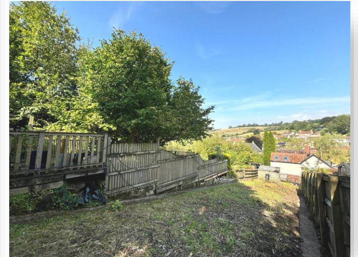
East View Cottages, Croscombe, Wells, BA5 3QR