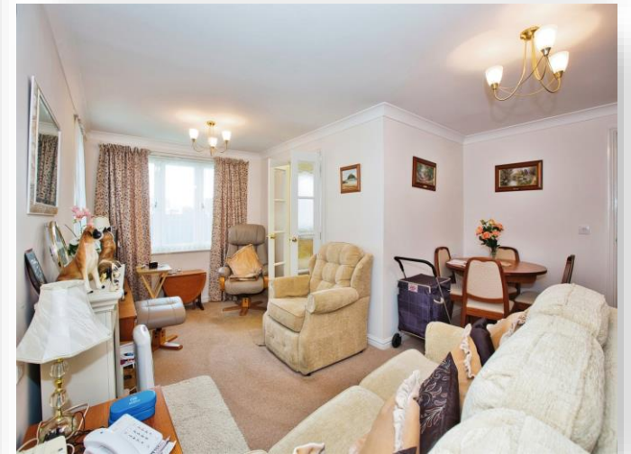
Tor View Court, Somerton Road, Street, BA16 0FE.