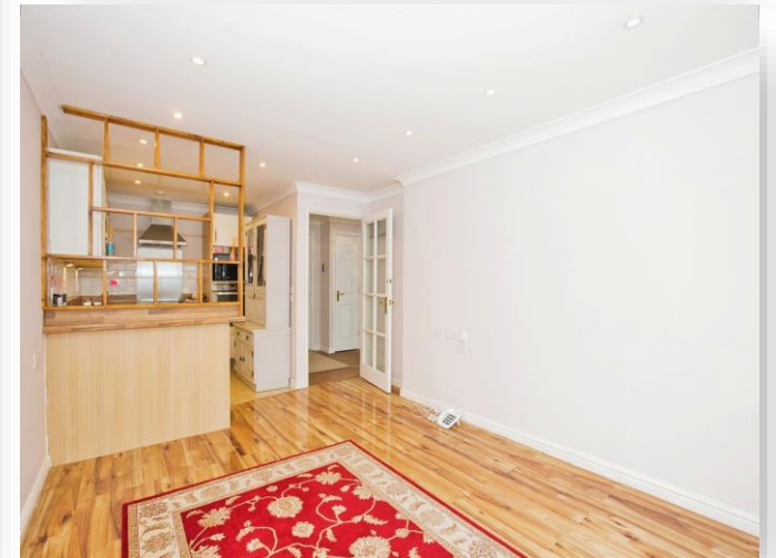
1 Tor View Court, Somerton Road, Street, BA16 0FE