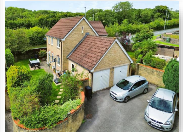
Knapp Hill Close, South Horrington Village, Wells, BA5 3HX