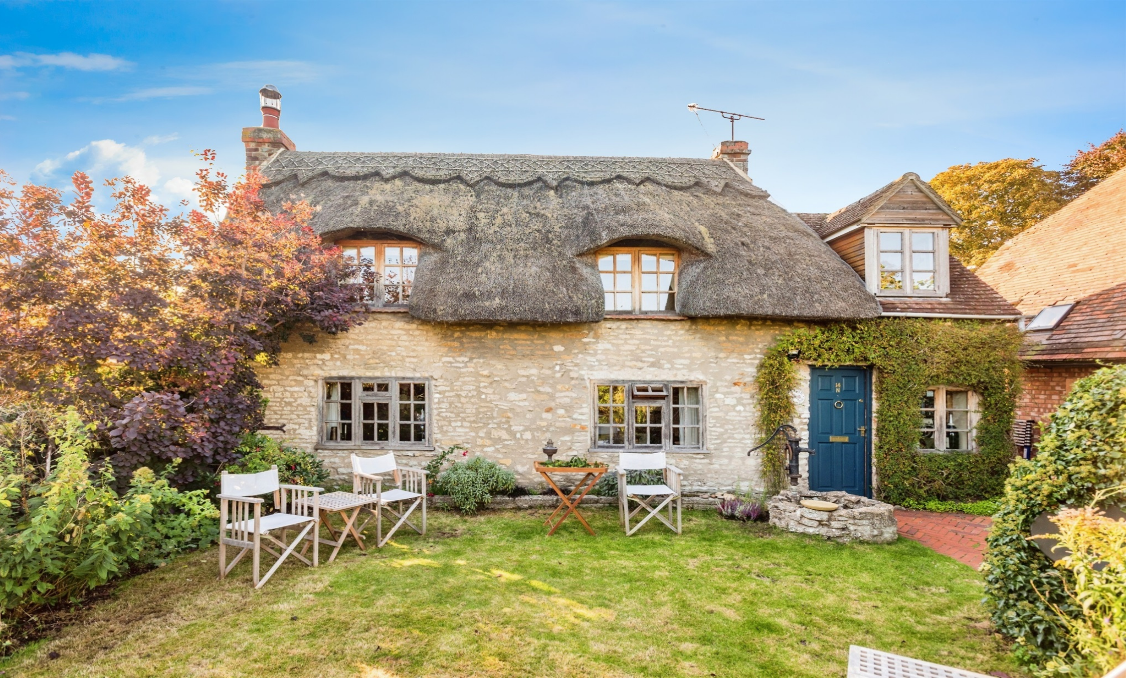
The Green North, Warborough, Wallingford, OX10 7HA