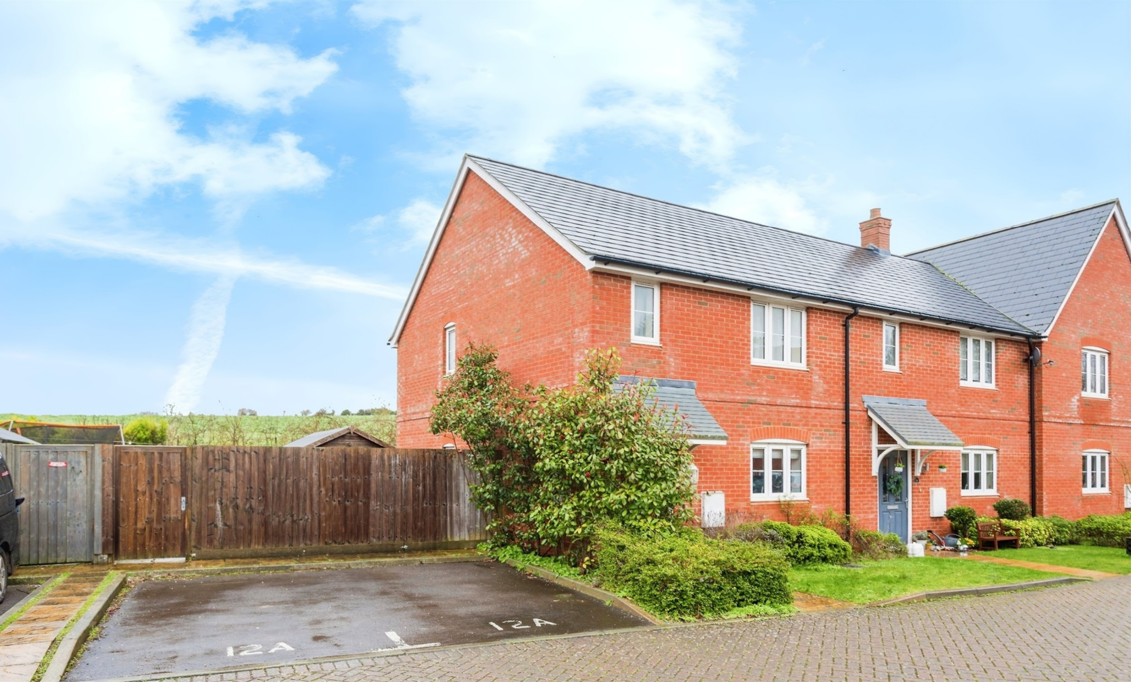
12a Icen Close, Goring, Reading, RG8 0AZ