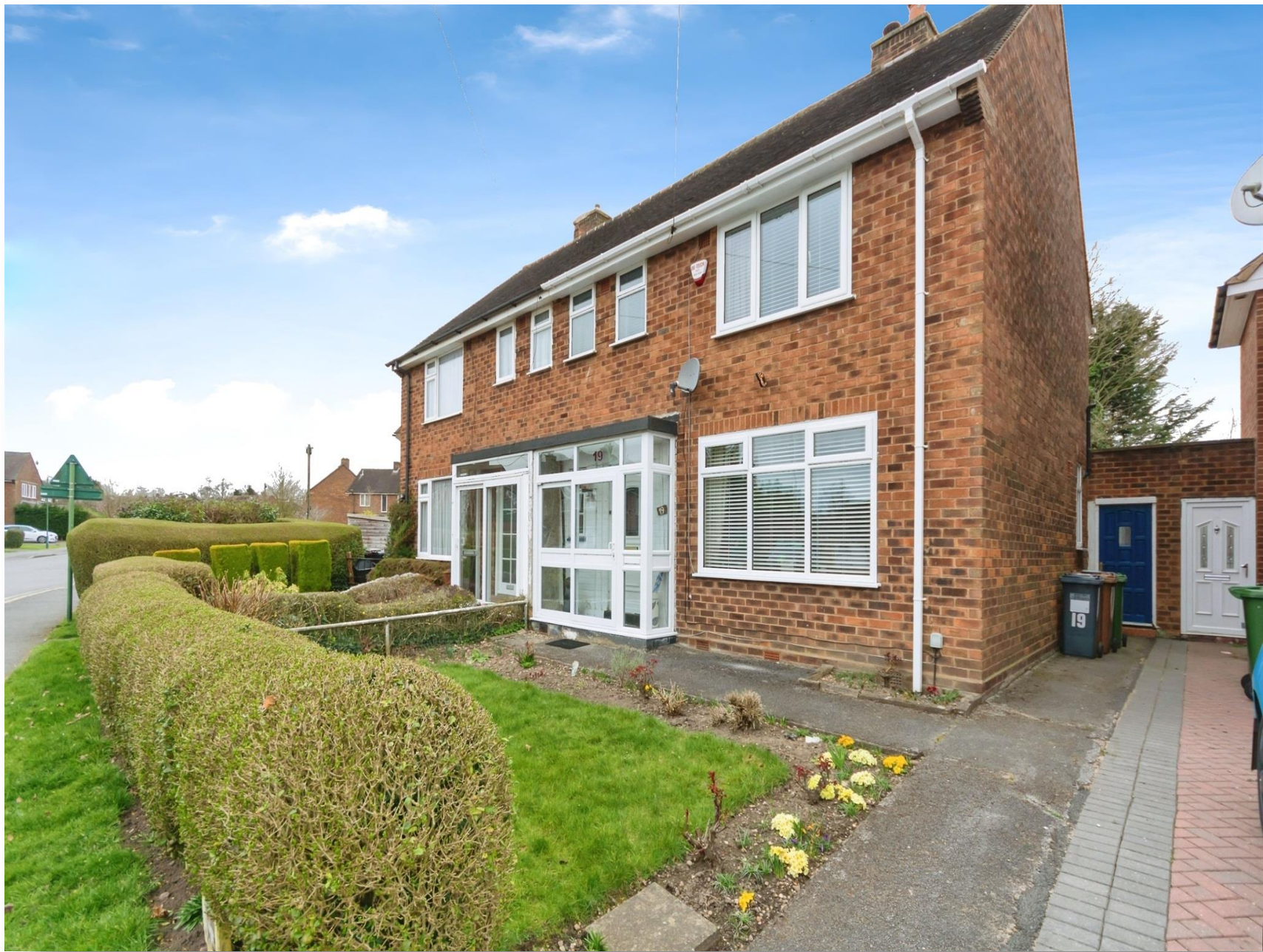
Glebe Road, Solihull B91 2LX