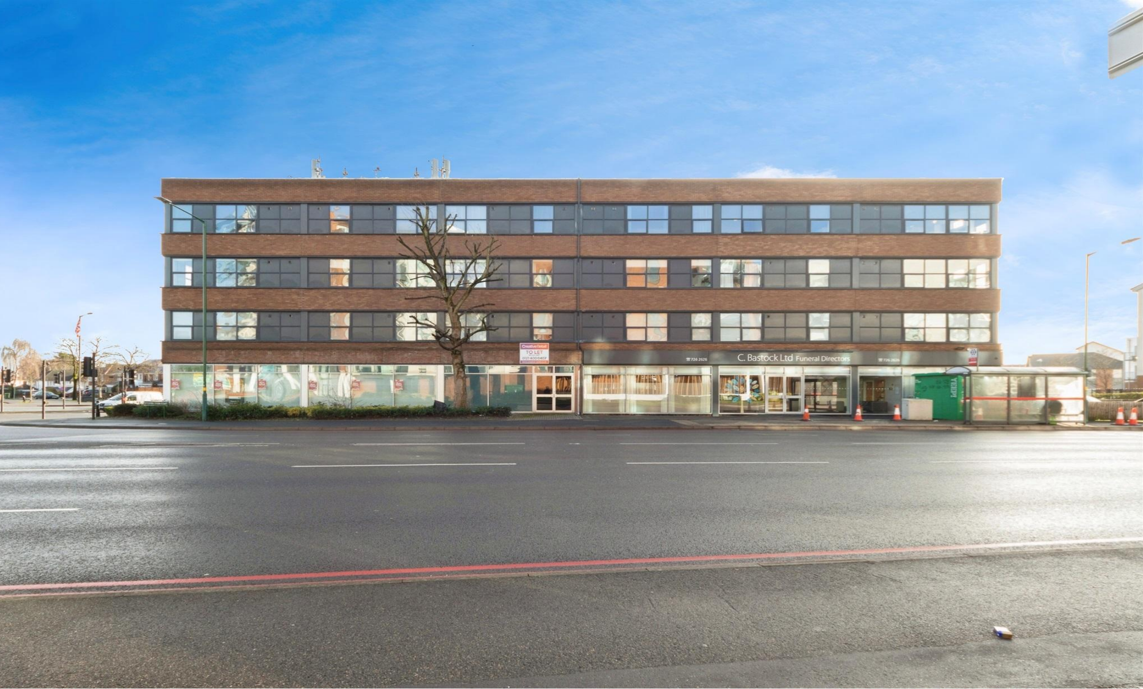
Century House Stratford Road, Shirley Solihull B90 3BH