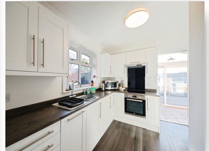
Clifton Green Baldwins Lane, Birmingham B28 0QF