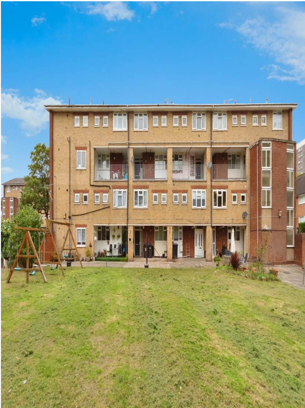
Nafford Grove, Birmingham B14 5HR