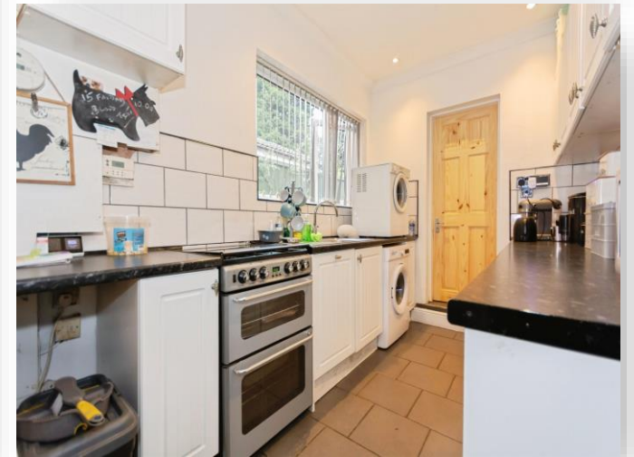
Manor Farm Road,BIRMINGHAM B11 2HT