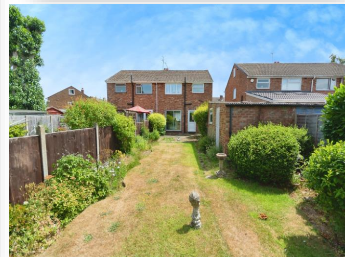
Clinton Grove, Shirley Solihull B90 4RS