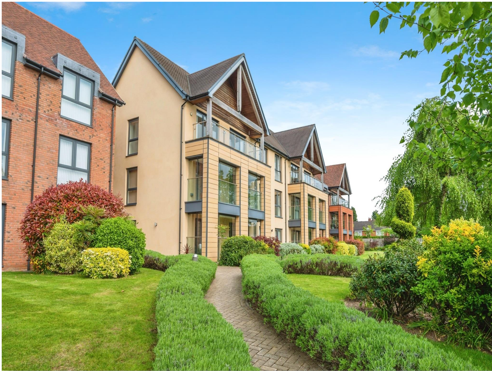
Scarlet Oak 911-913 Warwick Road, Solihull B91 3EP