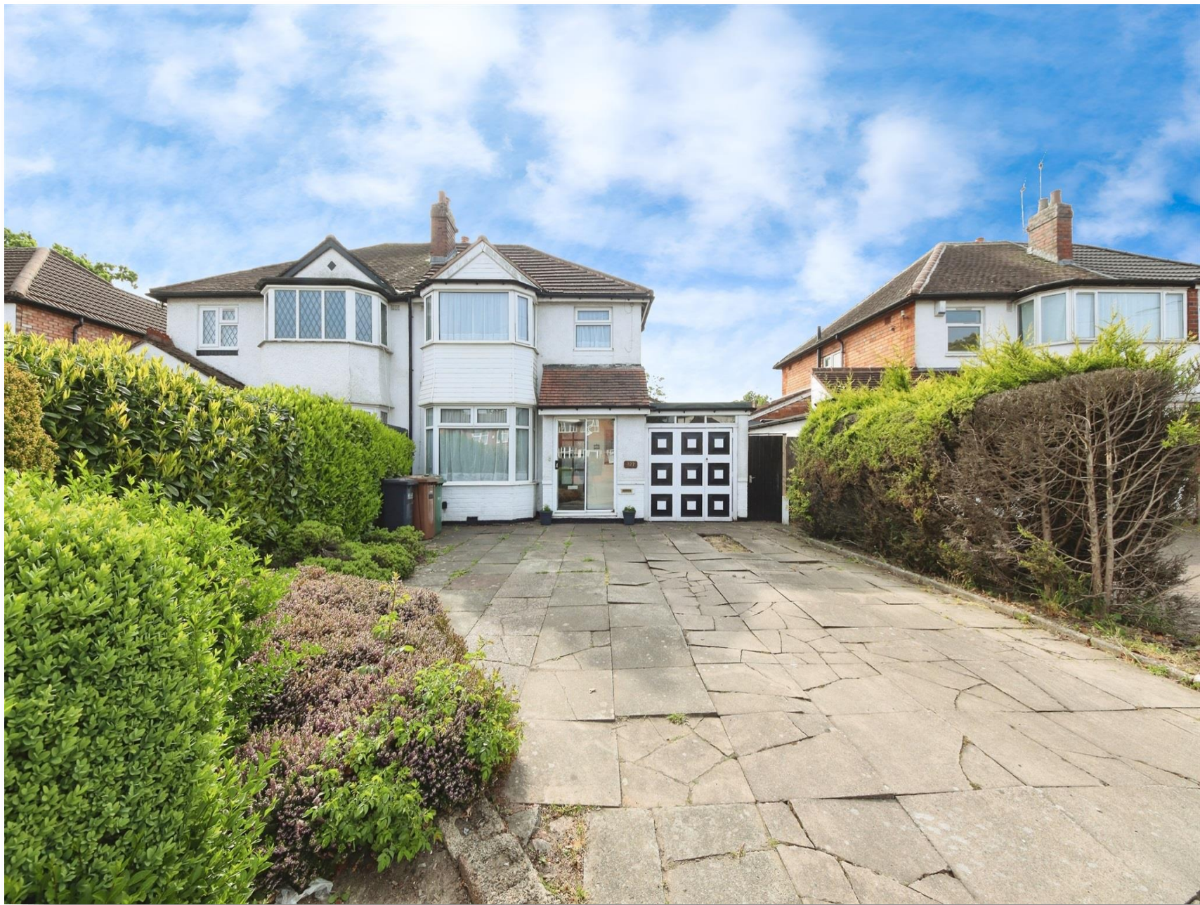
Haslucks Green Road, Shirley Solihull B90 2EF