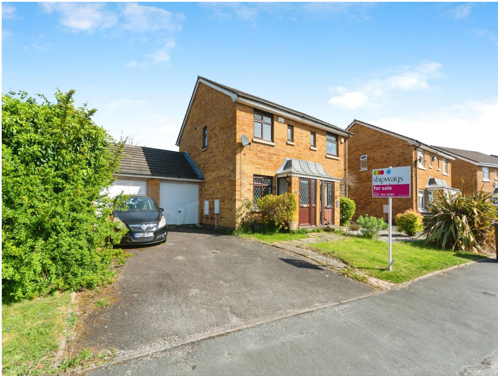
Westgrove Avenue, Shirley Solihull B90 4XN