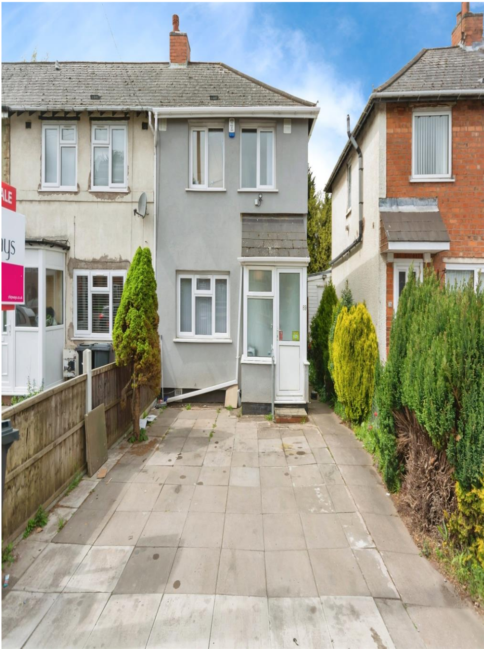
Tynedale Road, Birmingham B11 3QX