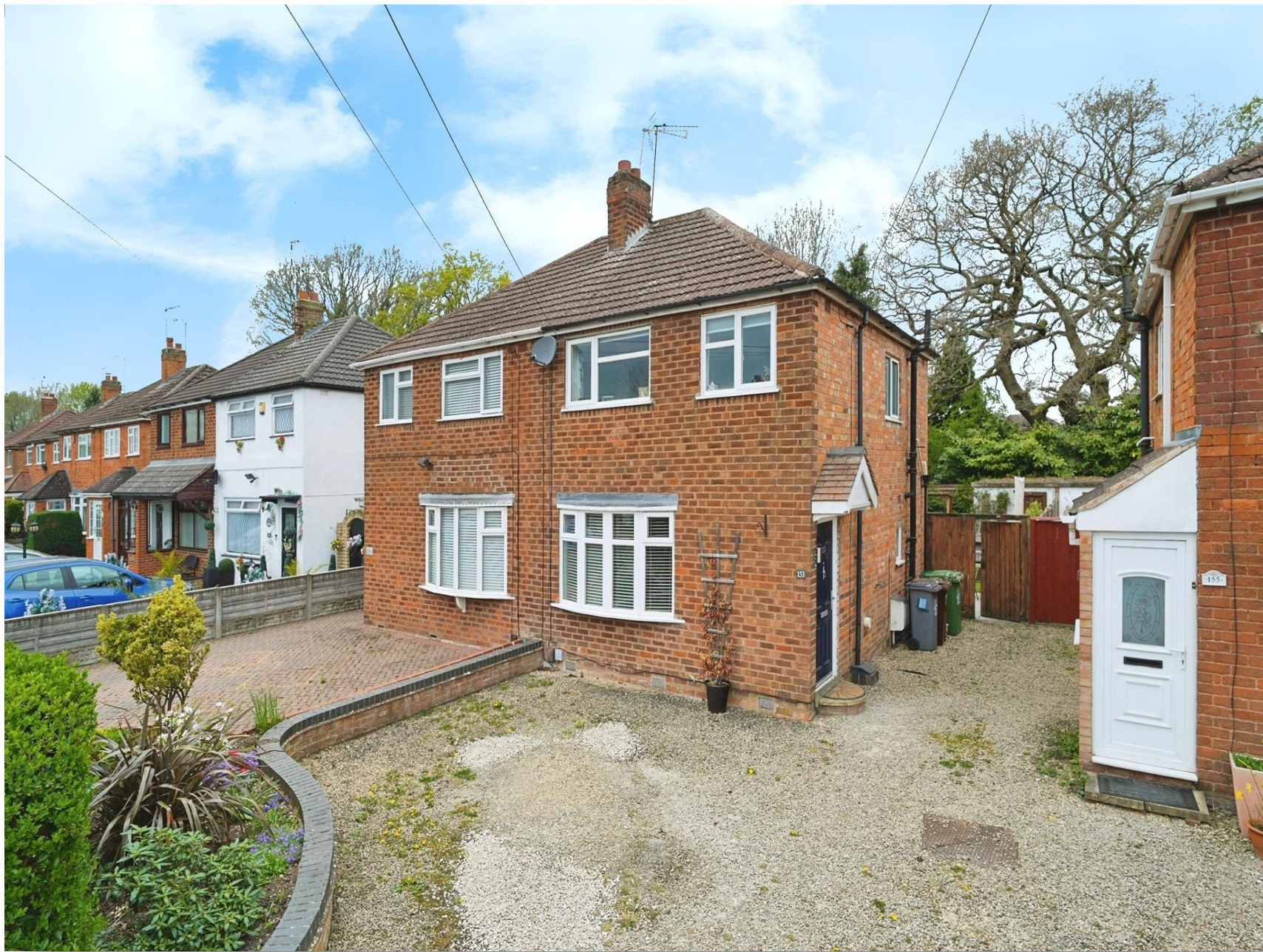
Chamberlain Crescent, Shirley Solihull B90 2DJ