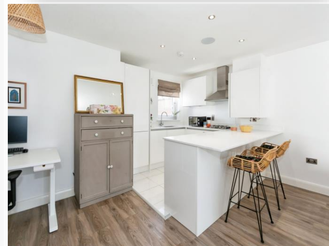
Apartment 26 Richard Lewis Way, Shirley Solihull B90 3FX