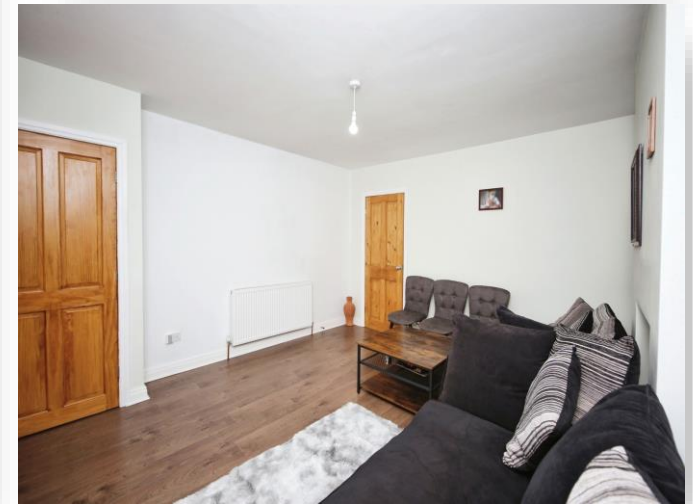
Gracemere Crescent, Birmingham B28 0TZ