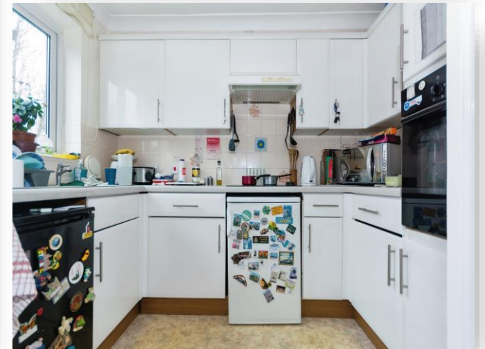
26 Rivendell Court Stratford Road, Hall Green Birmingham B28 8AT