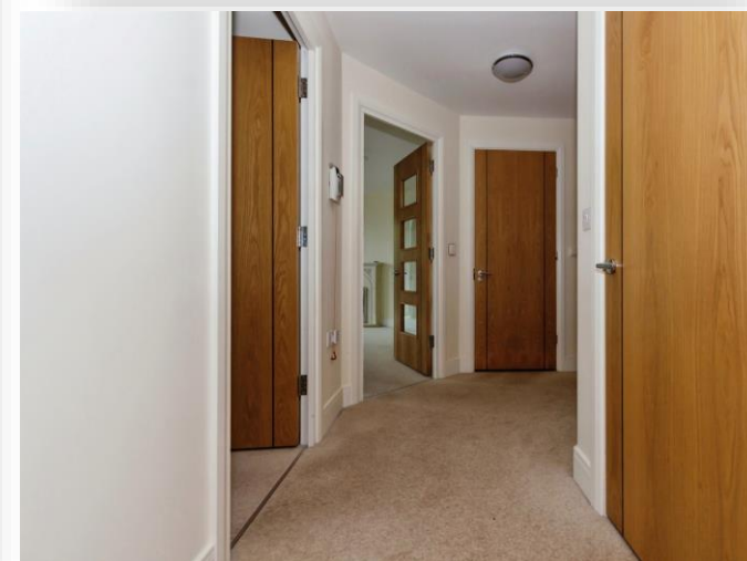
Dove Tree Court Stratford Road, Shirley Solihull B90 3AR