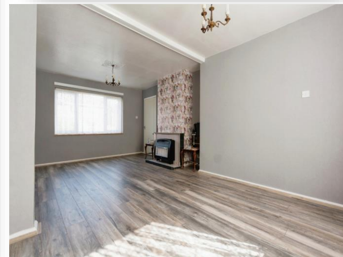
Barford Road, Shirley Solihull B90 3QR