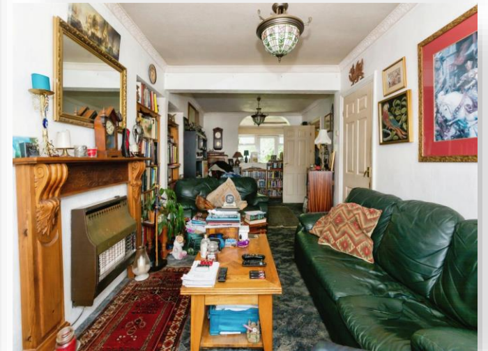
Bosworth Road, Birmingham B26 1EY