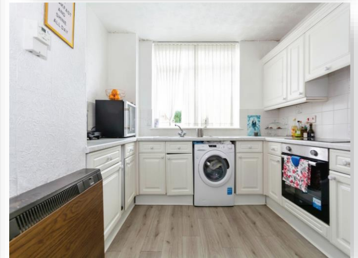
Stanley Close, Birmingham B28 0PS