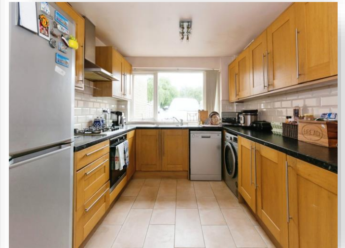
Braceby Avenue, Birmingham B13 0UP