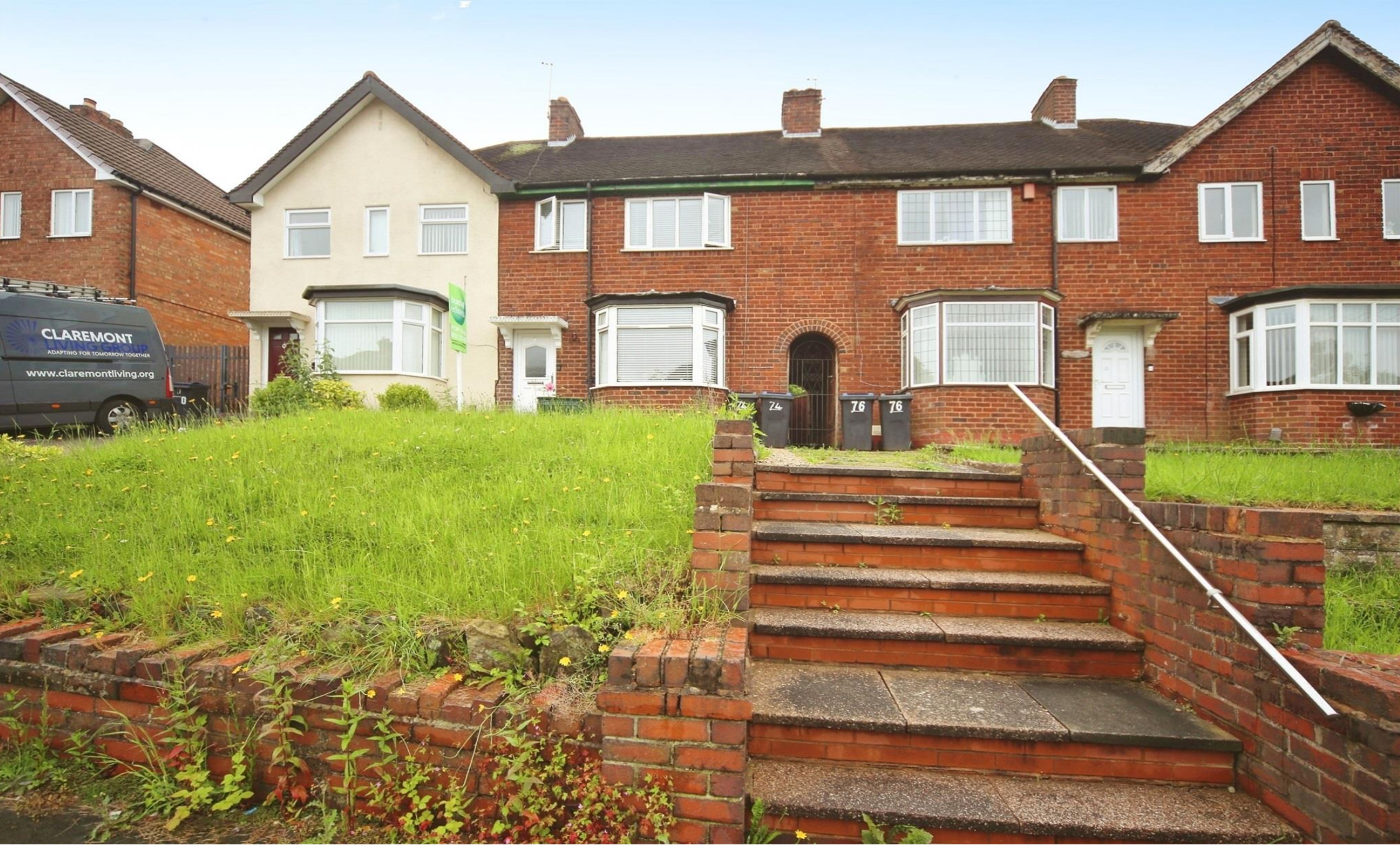
Gracemere Crescent, Birmingham B28 0TZ

Not for marketing purposes INTERNAL USE ONLY