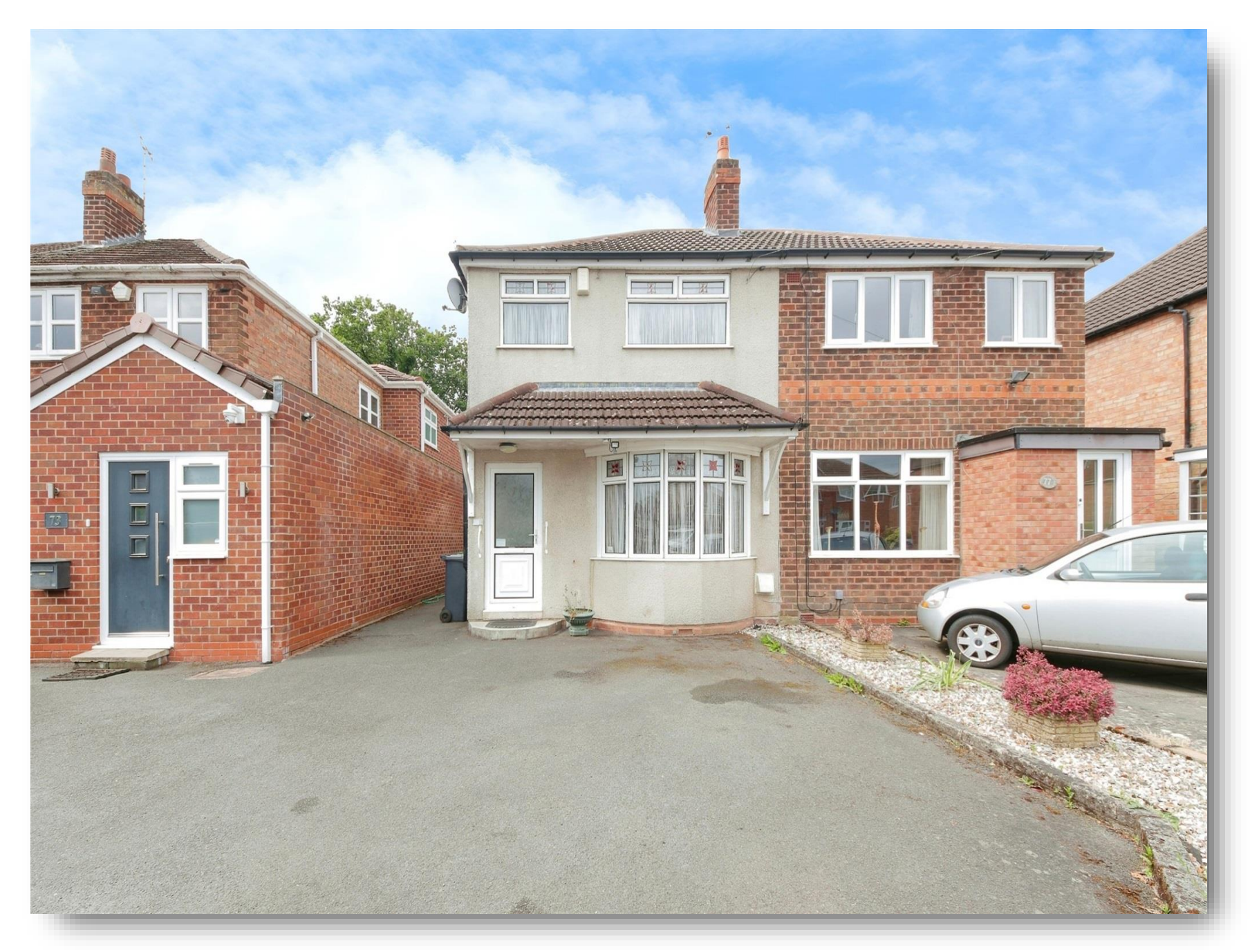
Chamberlain Crescent, Shirley Solihull B90 2DQ