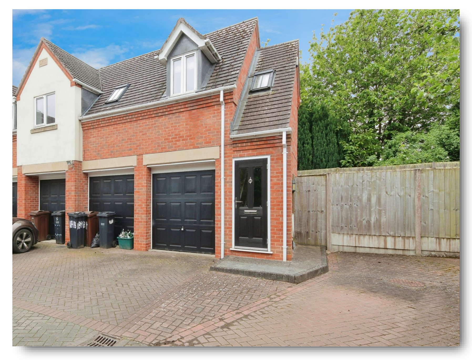
Marshall Lake Road, Shirley Solihull B90 4RH