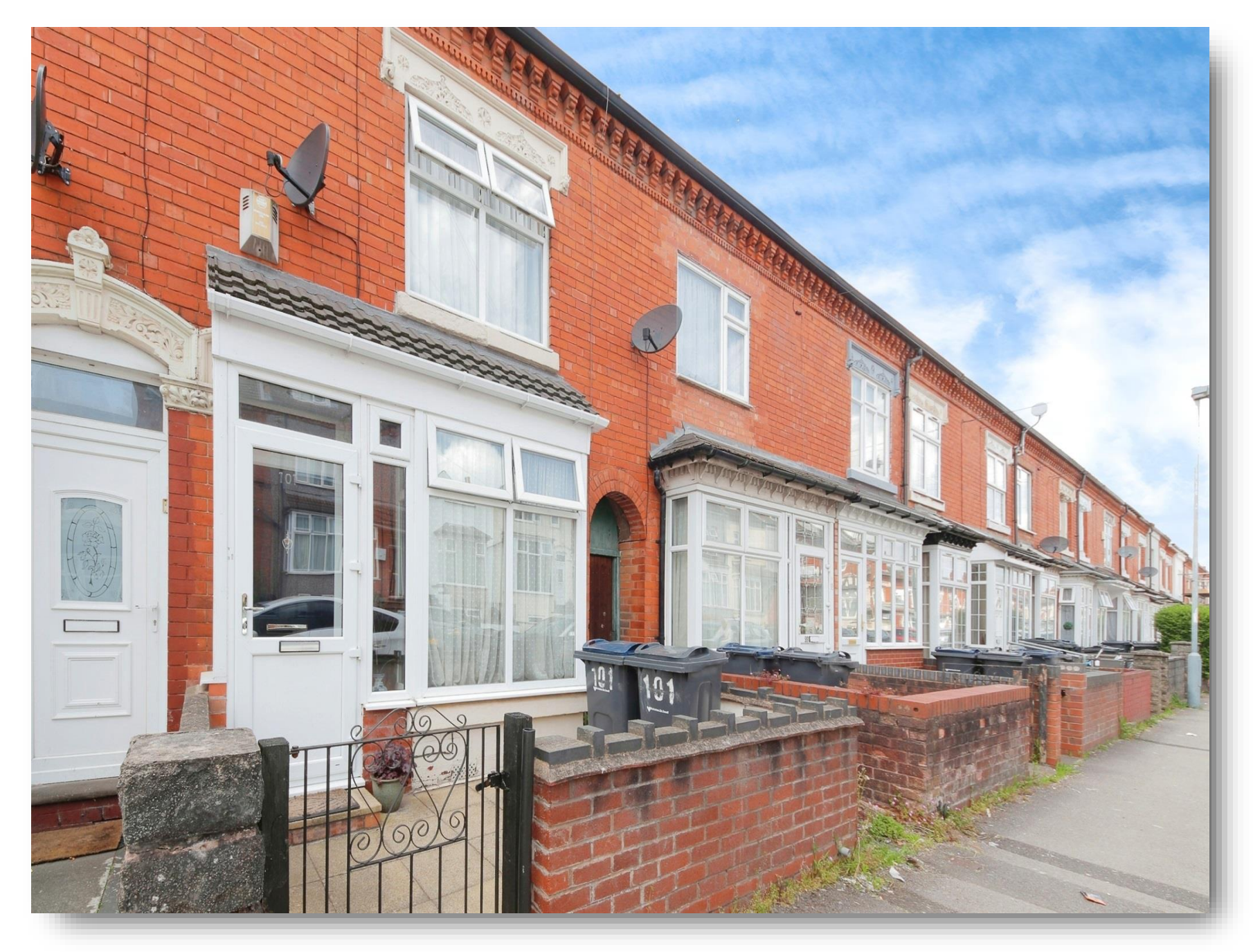
Knowle Road, Birmingham, B11 3AJ