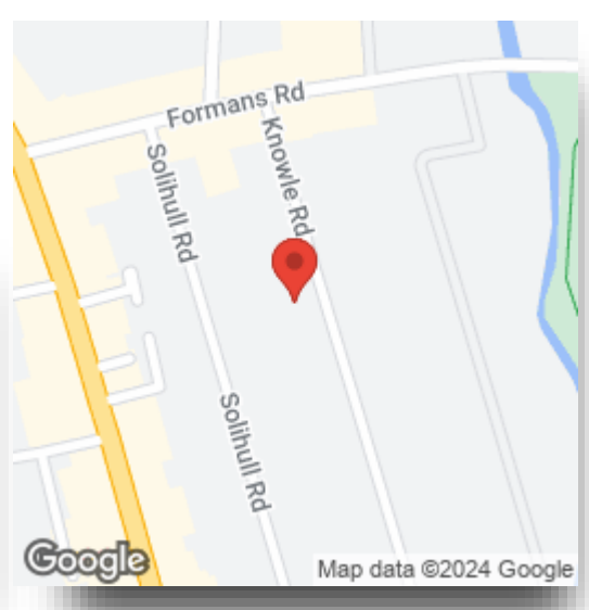
Please note the marker reflects the postcode not the actual property