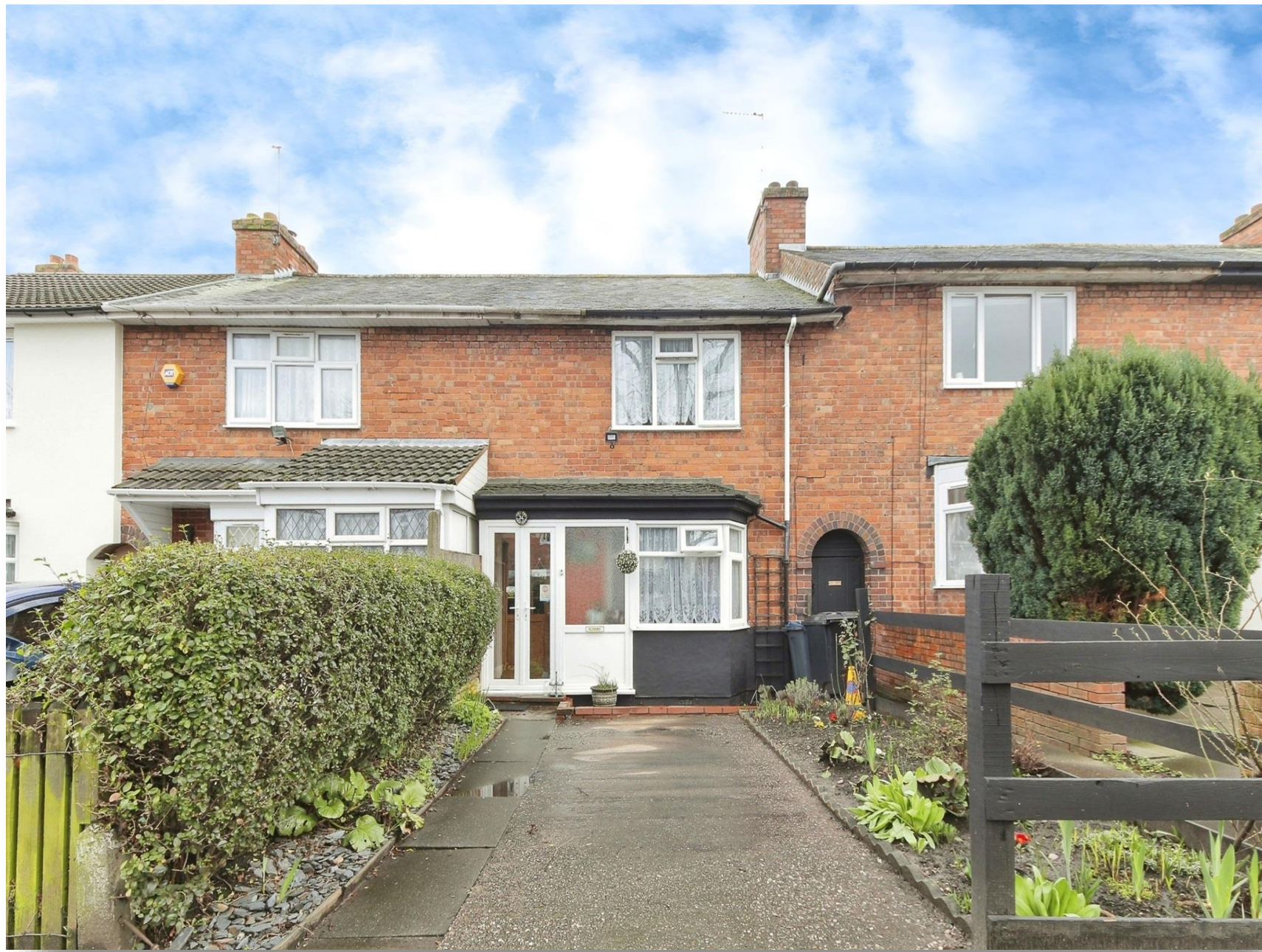
Springcroft Road, Birmingham B11 3EL