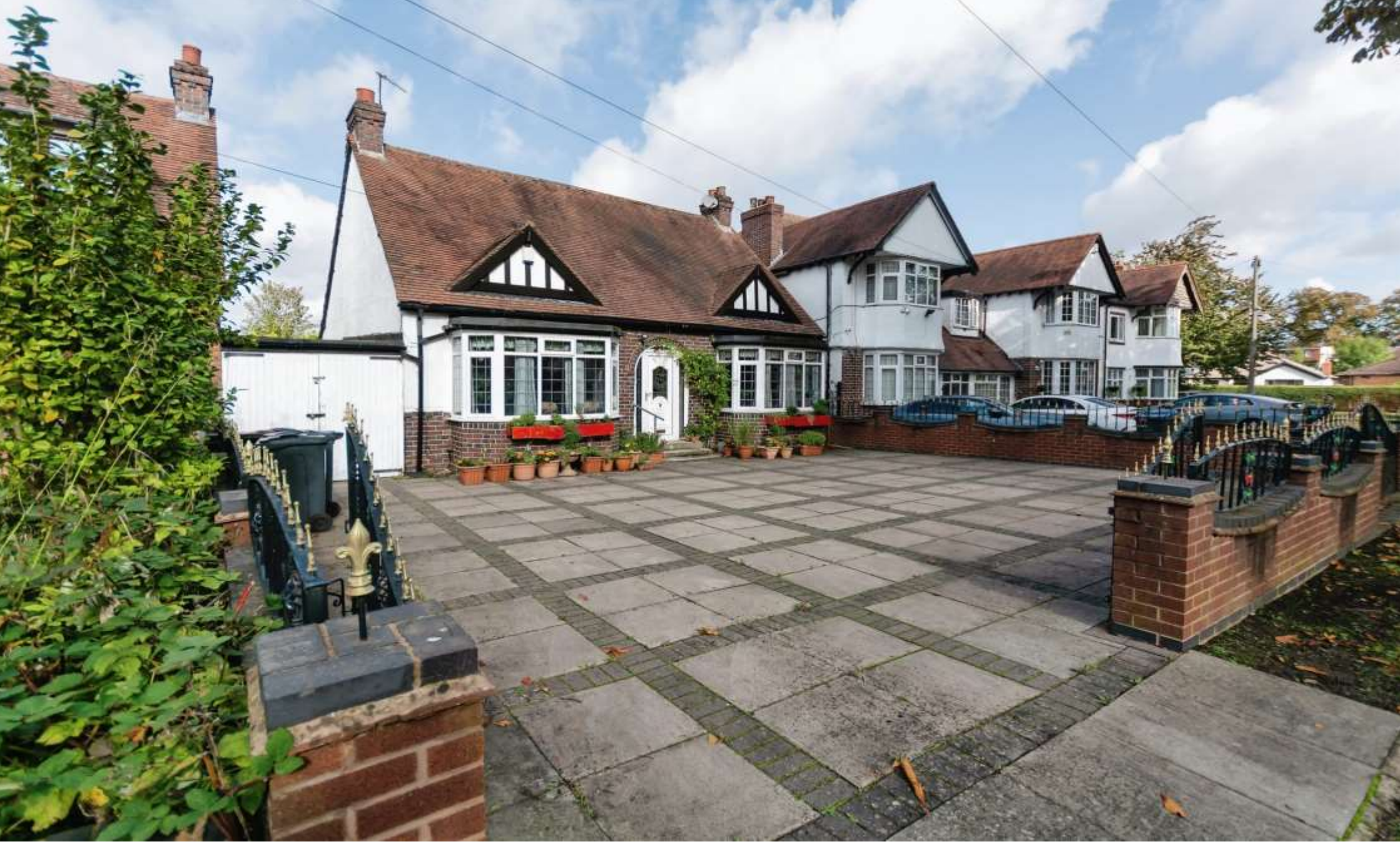
Highfield Road, Hall Green Birmingham B28 0BT