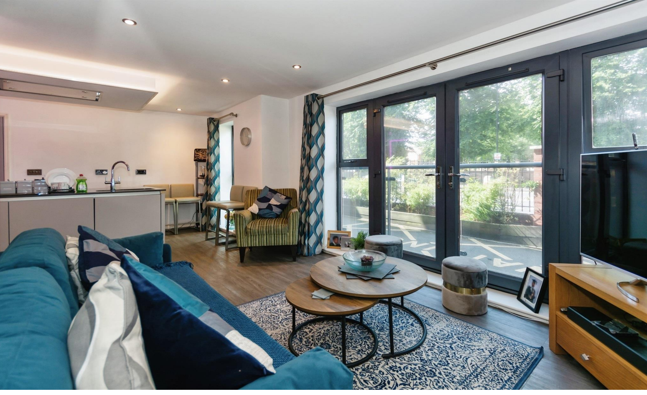
St James Court Stratford Road, Shirley Solihull B90 3BL