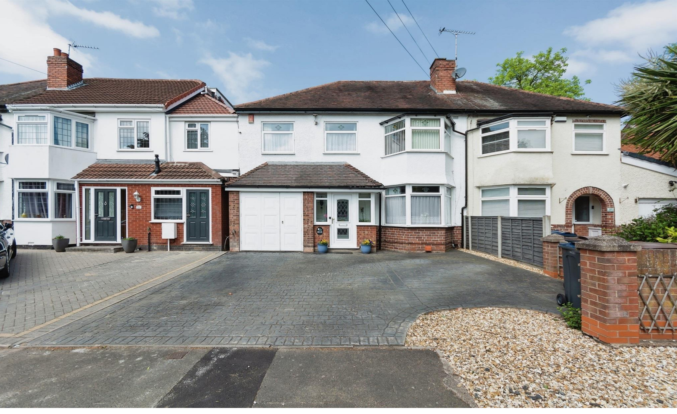
Baldwins Lane, Birmingham B28 0PZ