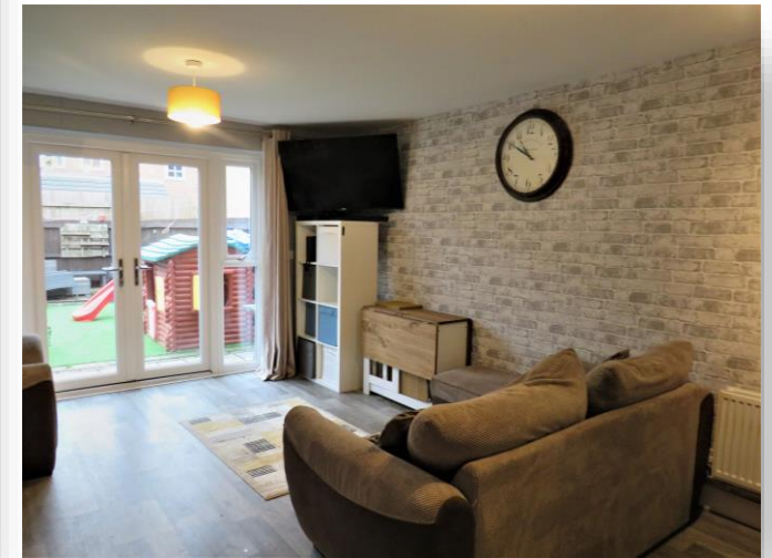
Rhodfa Bryn Rhydd, Talbot Green Pontyclun CF72 9FD