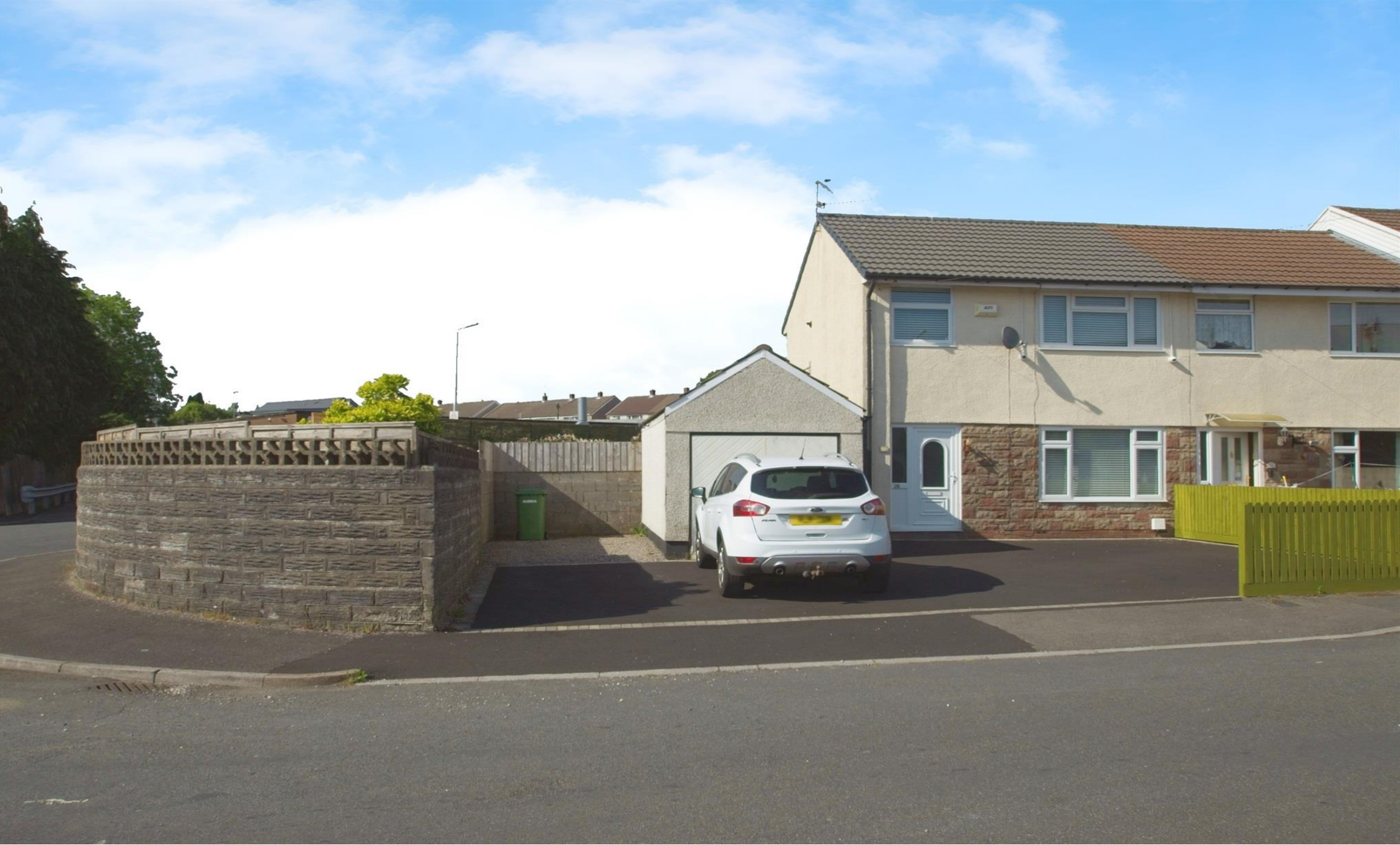
Heol Treferig, Beddau Pontypridd CF38 2SW