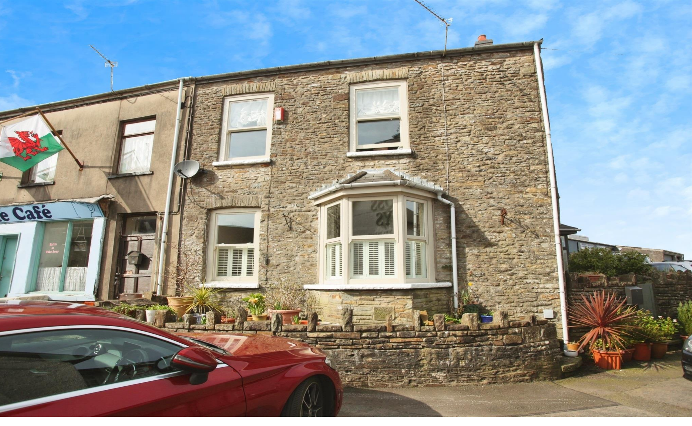
High Street, Llantrisant Pontyclun CF72 8BR