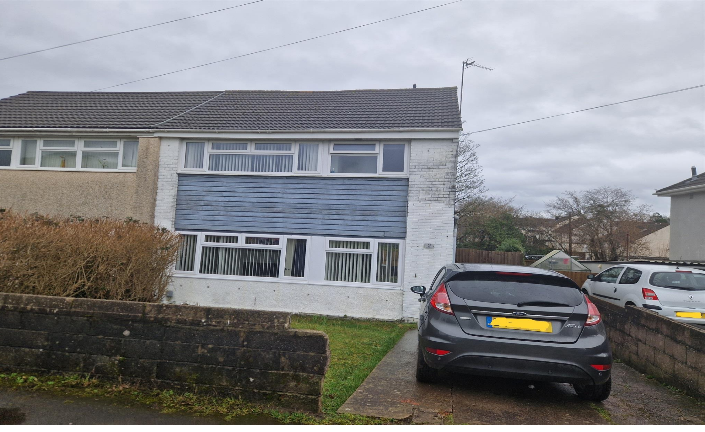
Bronhaul, Talbot Green Pontyclun CF72 8HW