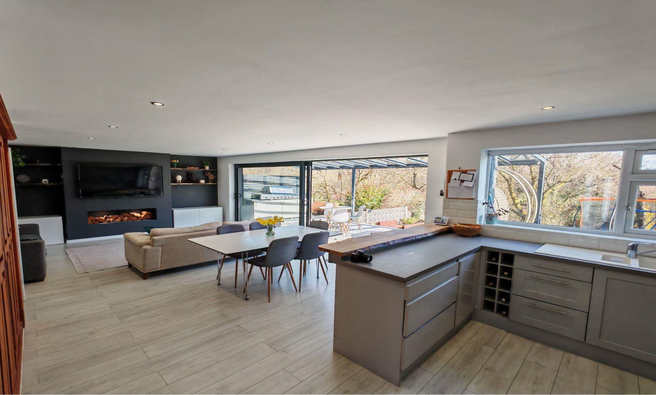
Pine Court, Talbot Green Pontyclun CF72 8LA