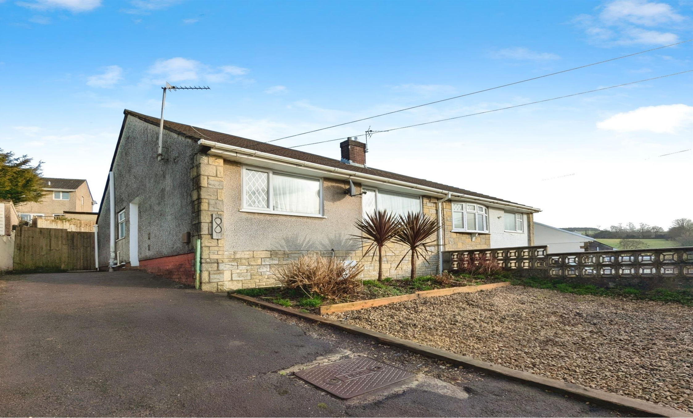
Tredegar Close, Llanharan Pontyclun CF72 9QU