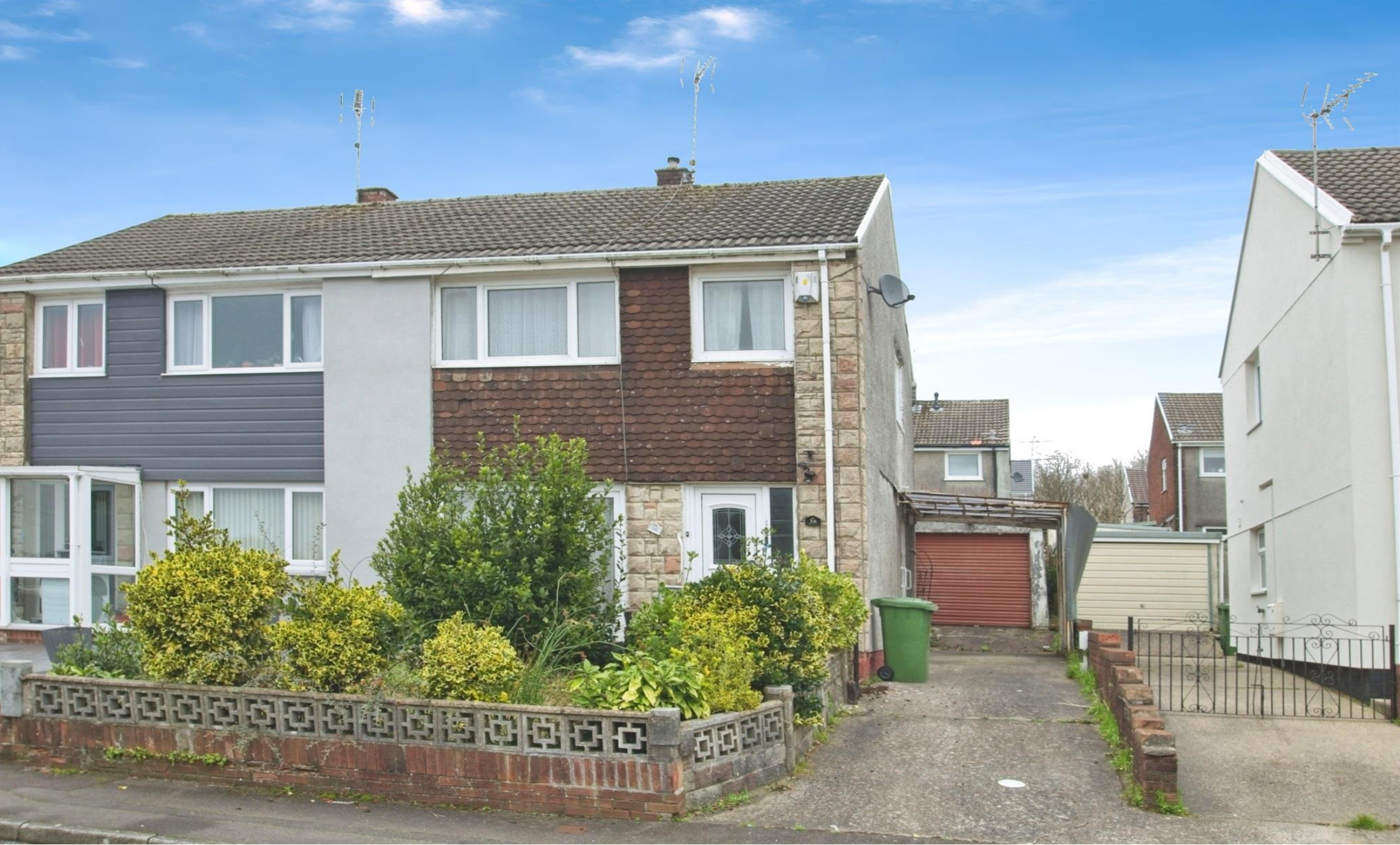
Oakfield Crescent, Tonteg Pontypridd CF38 1NG