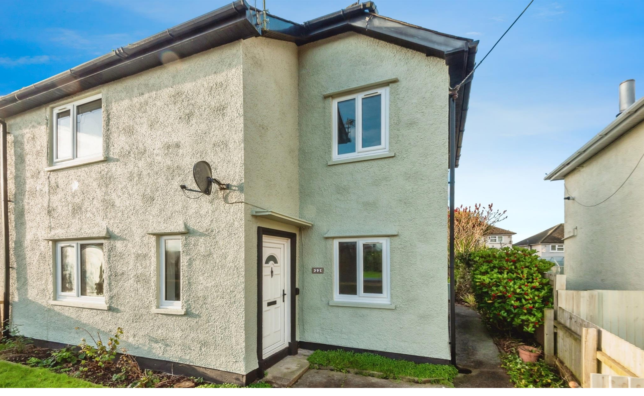
Cardiff Road, Llantrisant Pontyclun CF72 8DH